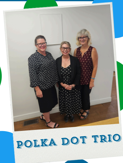
POLKA DOT TRIO